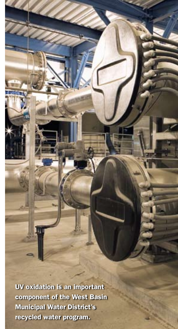
UV oxidation is an important component of the West Basin Municipal Water District's recycled water program.

As shown in Figure 1, the process train begins with automatic backwashing strainers to remove large particles in the secondary effluent feed supply. MF is then used to produce clean water for the RO system. Filtrate from the MF system is discharged into a break tank, which equalizes